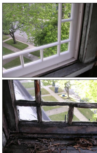
The same window before and after restoration

Another aspect in which the economic argument often favors the restoration approach is with respect to the whole building view. Often when a property owner embarks on a window replacement project it is because a handful of original windows require some level of repair. It is rare that all windows will need full restoration or extensive repairs. It is typically the elevation most exposed to weather that has the most window deterioration; other, more sheltered elevations can be surprising in how well they have preserved original building materials such as windows. The first step for any property owner should be an assessment evaluating the condition of each window and prioritizing the order in which repairs are undertaken. Certainly, such an approach will result in a more lengthy process of overall window repair compared to wholesale replacement, however, it is a more economical approach. For example, let's say there are 20 windows in a particular house, five per elevation. If the south elevation is exhibiting the most deterioration likely due to the exposure, it is rare that a replacement window contractor would replace only those