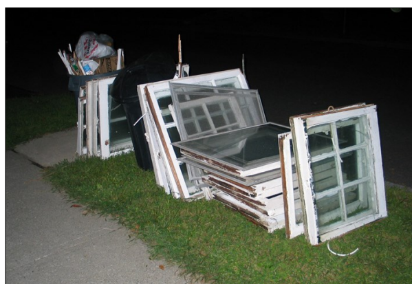
Windows on the curb awaiting trash pick up Kimberly Konrad Alvarez

Structures built prior to 1930 incorporated architectural elements, including windows that celebrated a particular style and craft in a variety of wood species, shapes, cuts and finishes. The insertion of a plastic or aluminum window into a building 80 years or older, therefore, can look out of place and can negatively impact the architectural integrity of the building. Windows offer some of the most reliable clues to understanding the history and evolution of a building and, by extension, a street block or whole community.